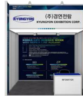
B- TYPE – Digital Printing + Board W 2,930mm X H 2,440mm