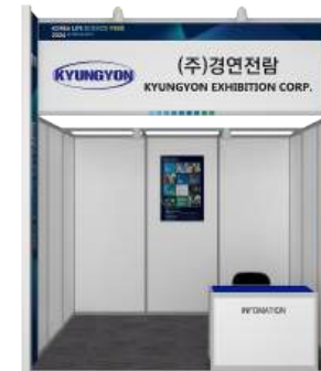
D - TYPE – Board Panel W 600mm X H 900mm