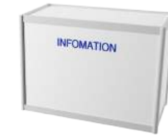
Information desk Size : 1000x500x750(H)