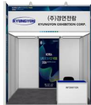
A- TYPE – Digital Printing W 970mm X H 2,392mm