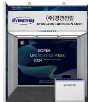
C- TYPE – Rolling Banner W 2,930mm X H 2,360mm , W 950mm X H 2,360mm